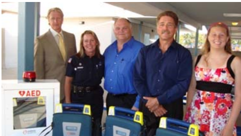
AED Donation to Poway Unified School District

In March, 2010 The Travis Fund co-funded an AED donation with the City of Temecula for placement in a local business (50/50 cost share between Travis Fund and City Fire Department).