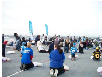
Mass CPR Training onboard the USS Midway in San Diego