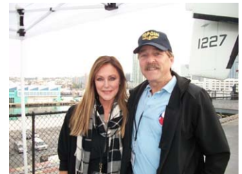
With Peggy Fleming at Mass CPR Training onboard the USS Midway

aircraft carrier museum USS Midway and 850 people were trained that day (also in attendance was Olympic Skating Champion Peggy Fleming who lost a sister to Sudden Cardiac Arrest.