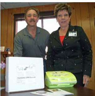
Donating an AED Trainer to San Jacinto Unified School District

In November, 2010, The Travis Fund donated an AED trainer unit to the San Jacinto Unified School District to supplement their training capabilities for staff.